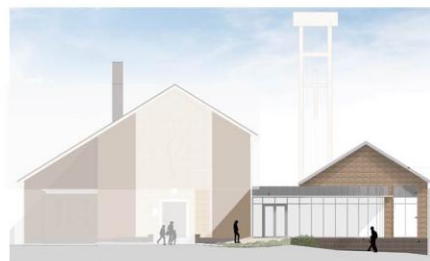
Architect's drawing of front of church with new hub

Church & Community Hub A facility for local groups and events as well as church use