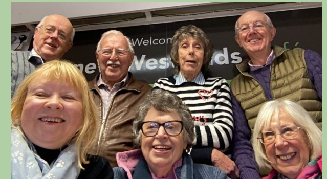
Members of the welcoming team

A Shared Space where it's OK not to be okay