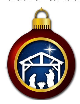
God with us

Even as a vicar I'm not sure I've any objection to those who enjoy a largely secular Christmas. Connecting up with family and friends, time off work to unwind, and enjoying many of the season's entirely secular traditions together are all of real value in themselves.